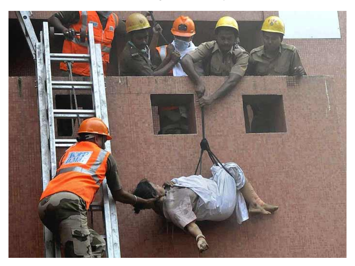
Exhibit 5 - Image of the rescue operation